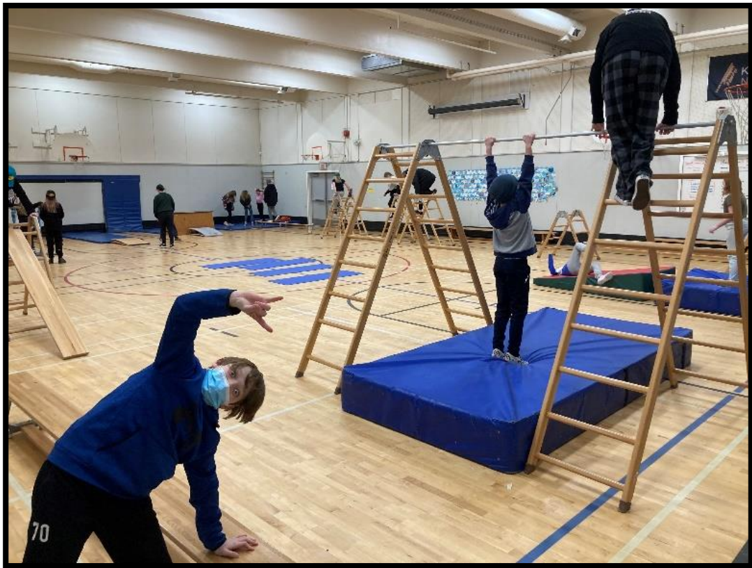
Our students are in a 2-week block of gymnastics / parkour in the gym. This week students are working on landings, strength, balance and fundamental movement skills.