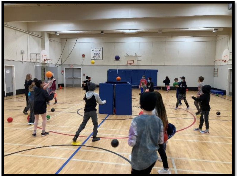
Students working on their basketball form in a game called "popcorn ball"