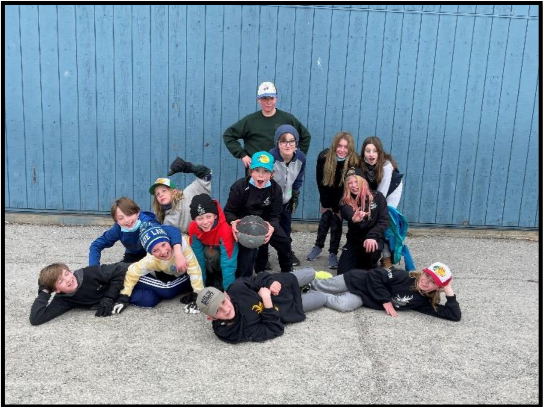
Some of the grade 6 students have started playing basketball in the old hoops at recess.